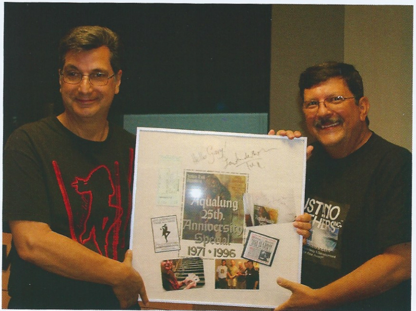
Aqualung 25th Anniversary.

Jethro Tull and Ian Anderson names, logos, likeness, and music are registered and copyrighted by Ian Anderson Group of Companies, LTD. The Jethro Tull App text, computer program, photographs, some artwork and compilations of videos on the playlist are copyrighted by the Fustino Brothers, Inc. All rights reserved.